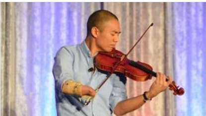
Sphinx Conference, Detroit, 21-23 February 2014 斯芬克斯大会, 底特律, 2014年2月21-23日 http://www.sphinxmusic.org/sphinxcon-past-speakers/

i2 Conference, Saudi Arabia | i2大会, 沙地阿拉伯 (2014) http://www.i2institute.org/impact/#schedule