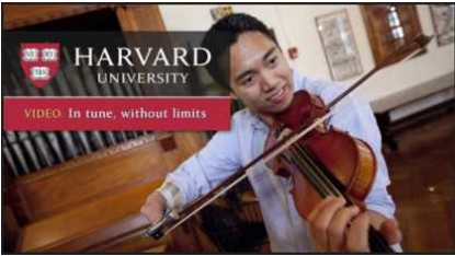
Harvard University, 21 March 2012 One-handed violinist combines art and teaching 哈佛大学, 2012年3月21日 独臂小提琴家将艺术与教育融合 https://www.youtube.com/watch?v=UxeP-z7W1oQ