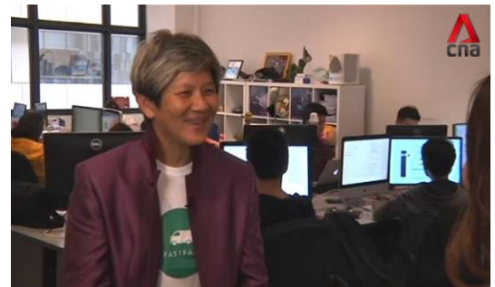
Channel NewsAsia, 9 May 2016 亚洲新闻台, 2016年5月9日 https://youtu.be/OKbrjRS0hTI