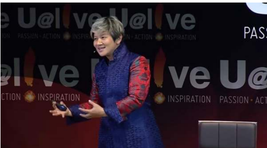
U@live at National University of Singapore, 11 Nov 2015 新加坡国立大学 U@live 讲座, 2015年11月11日 https://youtu.be/L9ro186Jst8