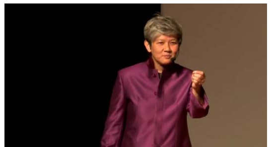
TEDx Talk, 1 Jun 2016 TEDx 演讲, 2016年6月1日 https://youtu.be/qCpF3Q0SSKA