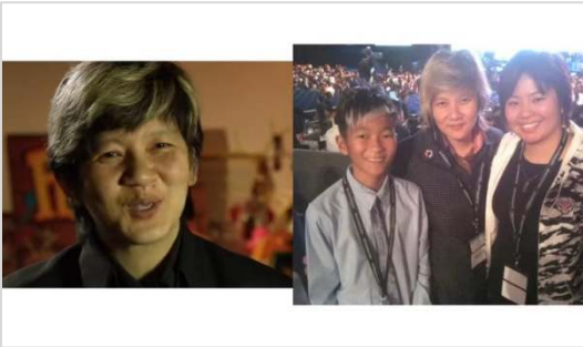
The Story Exchange, 28 Oct 2011 故事交流, 2011年10月28日 https://youtu.be/Yt2f2Kn8Fvs