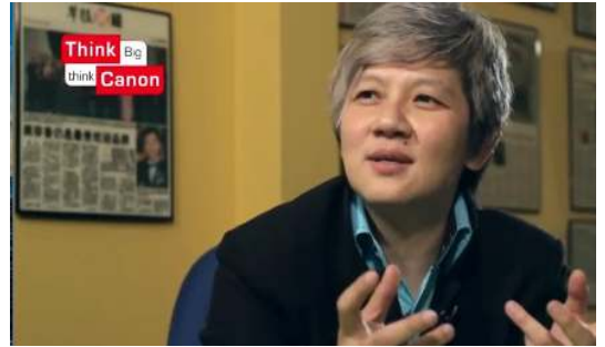
Canon Thinkbig, 28 Dec 2011 佳能 Thinkbig, 2011年12月28日 https://youtu.be/UodWmWZYpnc https://youtu.be/plvYjihCYzs