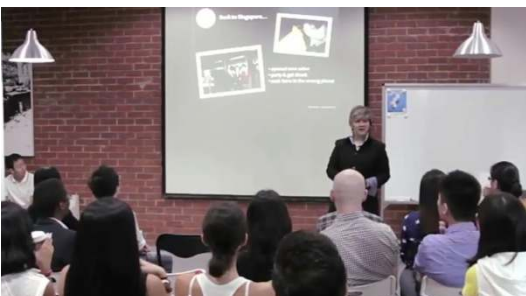
Creative Mornings Singapore, 28 Aug 2013 新加坡创意早晨讲座, 2015年8月28日 https://youtu.be/FFvQAckszXo